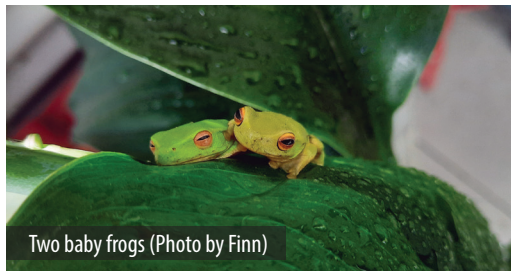
Two baby frogs